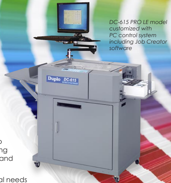
DC-615 PRO LE model customized with PC control system including Job Creator software

The easy-to-use DC-615 features an LCD control panel that guides the user through the setup of the slit, cut, and crease positions. With 80 memory settings, commonly used jobs can be conveniently stored. In addition, the automatic vacuum feeding system accurately feeds documents making the DC-615 a highly productive slitting, cutting, and creasing finishing solution.