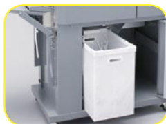
Margin, gutter slit, and gutter cut strips are automatically disposed in waste bin.