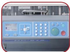
Large user-friendly LCD control panel conveniently stores job names.