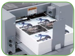
3.9"-capacity continuous automatic feeder allows for non-stop productivity.