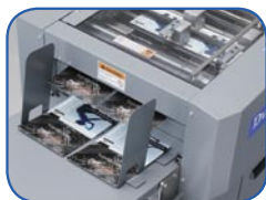
Adjustable receiving tray accommodates longer finished sizes. Plexiglas® cover provides direct view of machine in operation.